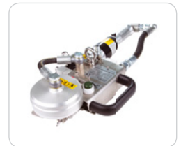
SM-FT-3000-19 or SM-FT-3000-32