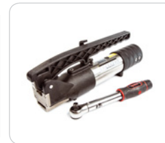
SM-FT-1000-20ST or SM-FT-1000-32ST