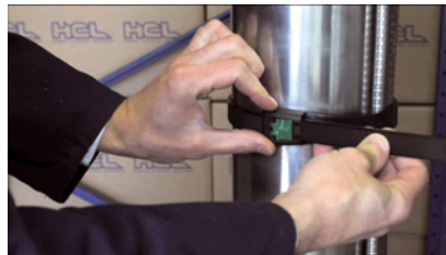
Smart® Tie and SM-FT-2000-19 Hand Tool

Demonstration videos are available to view on our website.